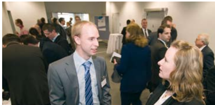
Impression from 2nd European Networking Event, March 2010